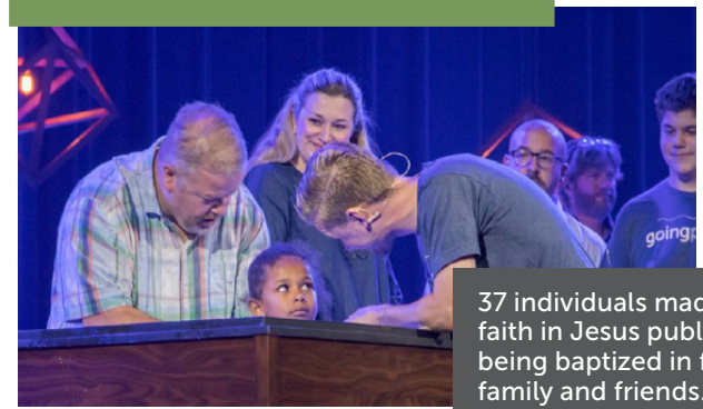
37 individuals made their faith in Jesus public by being baptized in front of family and friends.

GFC partnered with Restore Ukraine to provide shoes, coats, and other clothing items for the people of war-torn Ukraine.